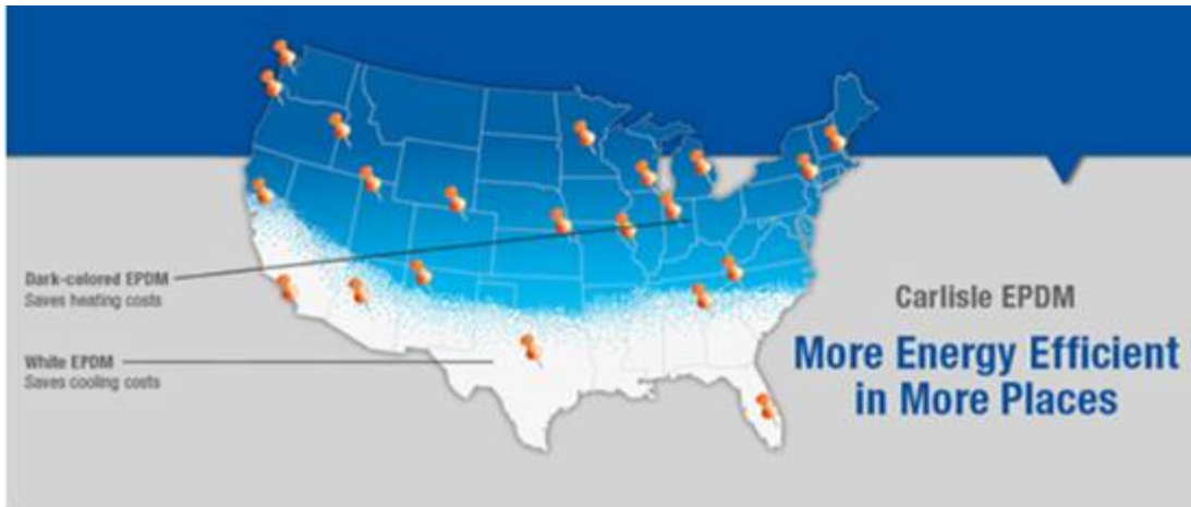
Figure 1: Heating vs. Cooling climate zones