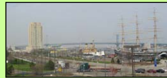
Access to Columbus Boulevard and Philadelphia Waterfront