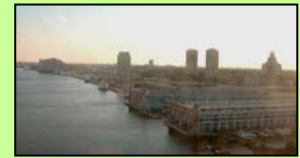
Access to Piers 3 and 5 on the Philadelphia Waterfront