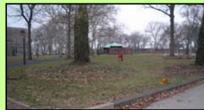
Use of Existing Franklin Square Station

Phase II - This alternative could eventually be extended south along Columbus Boulevard to the naval yard and sports stadiums.